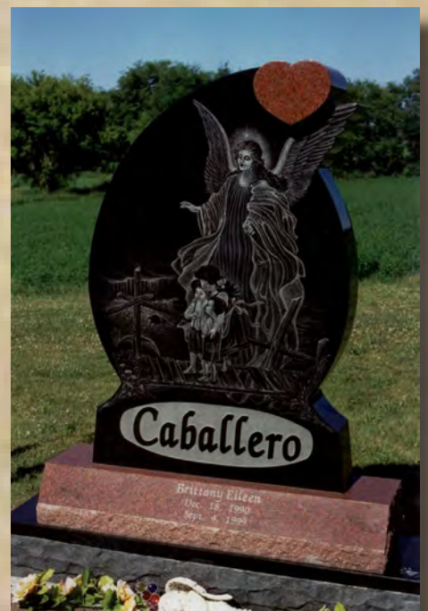
Upright Memorial India Black 36x8x60 Tablet 48x14x8 Base