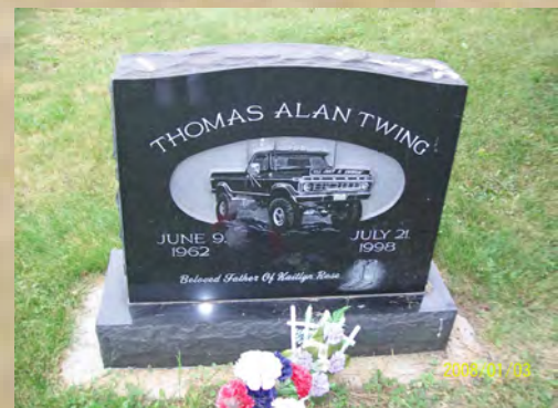
Upright Memorial India Black 30x6x30 Tablet 40x12x6 Base