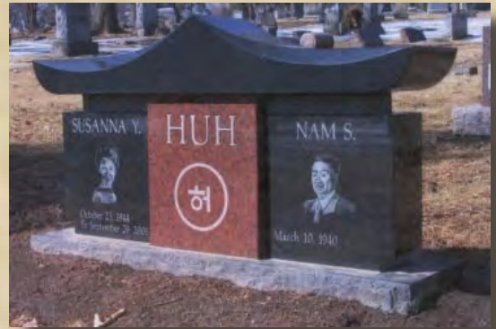
Upright Memorial India Black Custom Design