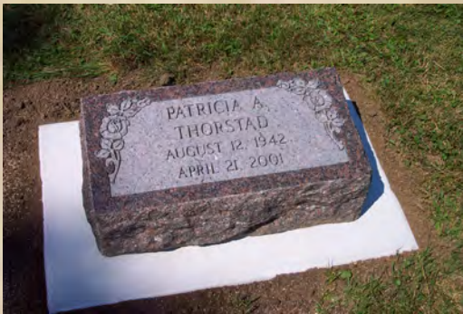
Bevel Memorial Dakota Mahogany 24x12x8