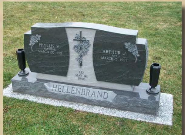
Upright Memorial American Black 48x6x24 Tablet 60x12x6 Base