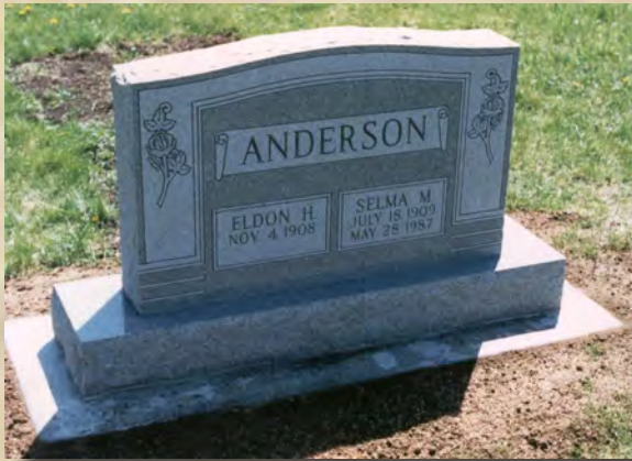
Upright Memorial Barre Gray 36x6x20 Tablet 48x12x6 Base

Please know that we can craft a design based on your requests