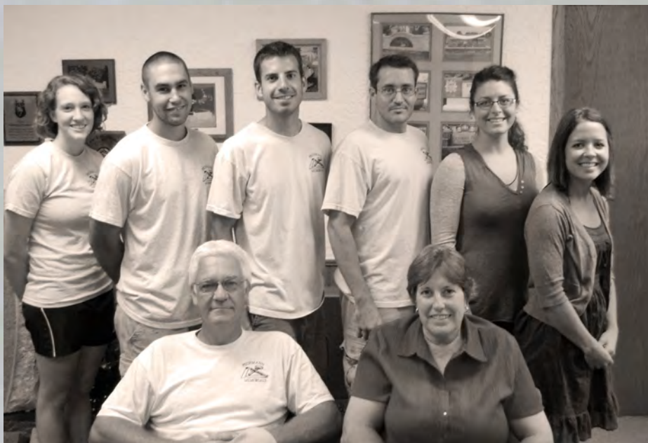
Main Office Staff