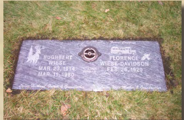
Flush Memorial Coral Blue 48x18x4