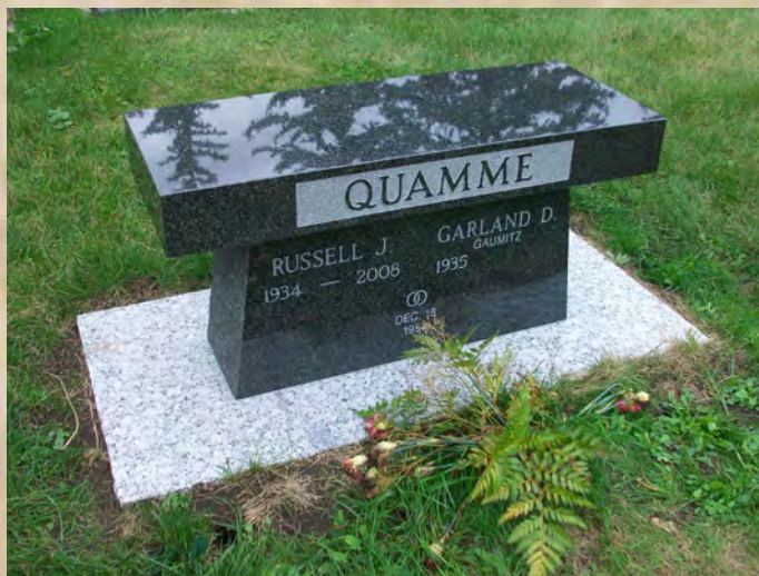
Bench Memorial Impala Black 36x14x4 Seat 28x6x14 Support