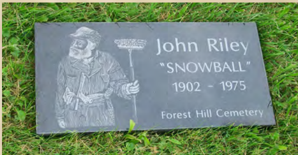
Flush Memorial India Black 24x12x4