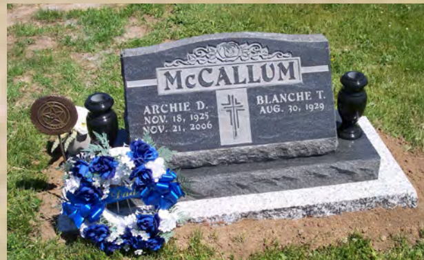
Slant Memorial American Black 30x10x16 Slant 42x14x4 Base