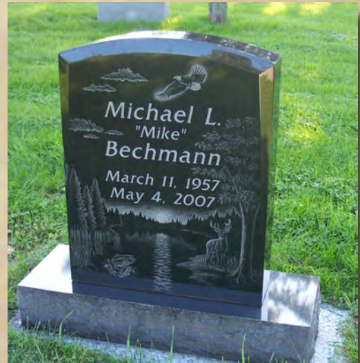
Upright Memorial India Black 24x6x30 Tablet 36x12x6 Base