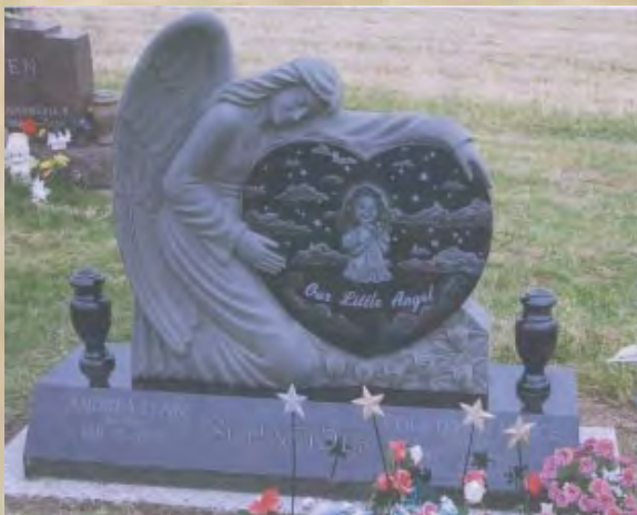
Upright Memorial India Black 36x8x36 Tablet 48x14x8 Base