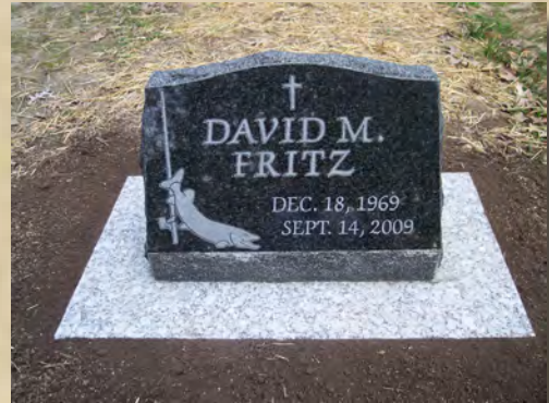
Slant Memorial Impala Black 24x10x16 Slant