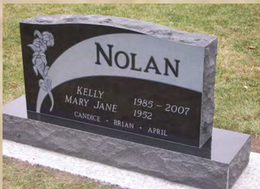
Upright Memorial India Black 36x6x20 Tablet 48x12x6 Base