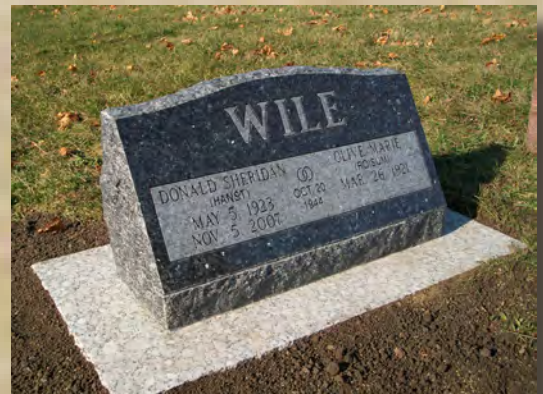
Slant Memorial Blue Pearl 30x10x16 Slant