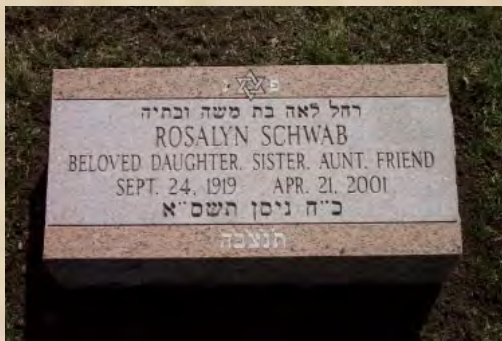
Bevel Memorial Salisbury Pink 24x12x8