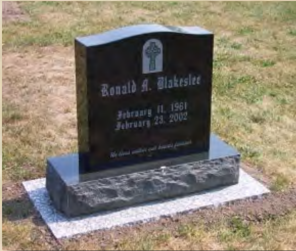
Upright Memorial India Black 24x6x20 Tablet 34x12x6 Base

Please know that we can craft a design based on your requests