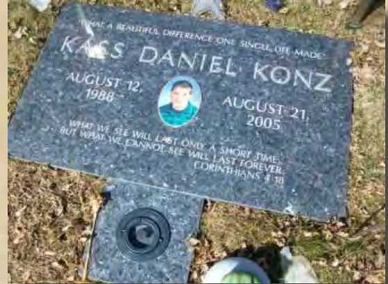
Flush Memorial Blue Pearl 36x22x4