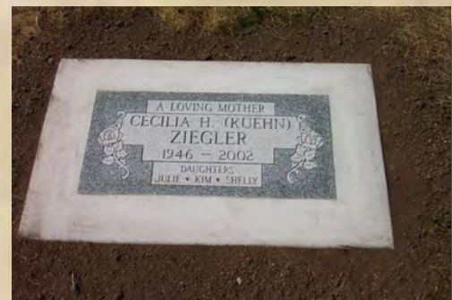
Flush Memorial Southern Gray 24x14x4