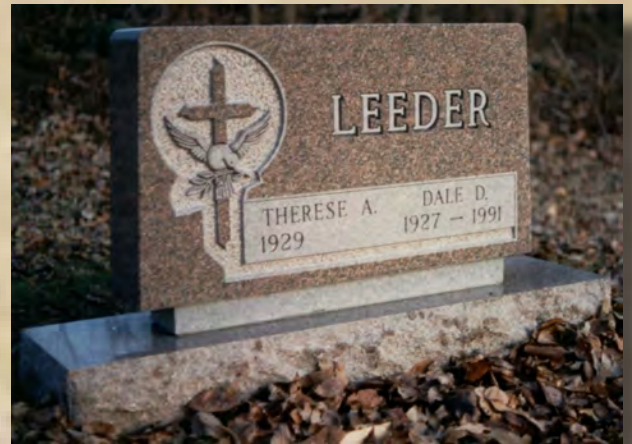
Upright Memorial Colonial Rose 36x6x22 Tablet 48x12x6 Base