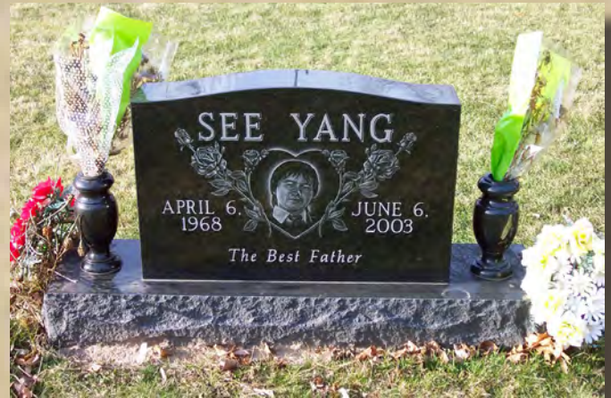
Upright Memorial India Black 30x6x20 Tablet 42x12x6 Base