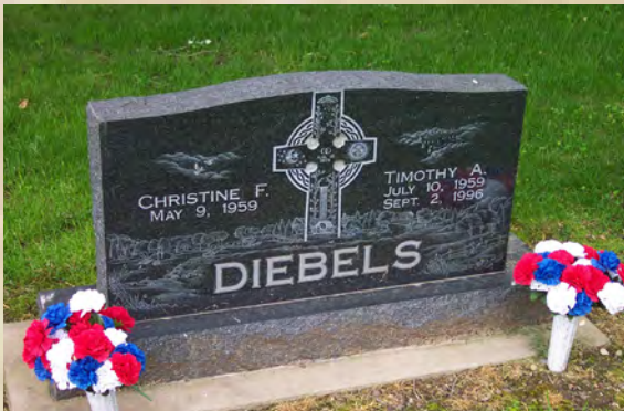
Upright Memorial India Black 36x6x20 Tablet 48x12x6 Base