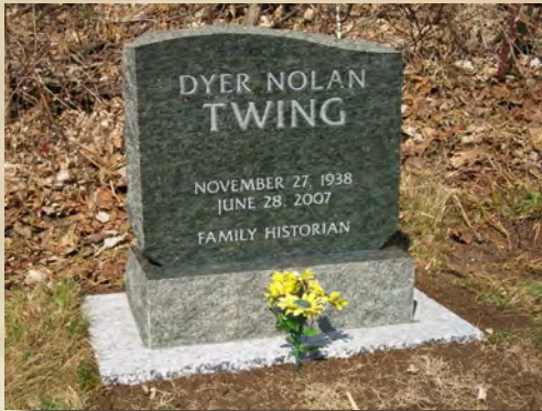
Upright Memorial Emerald Green 24x6x20 Tablet 24x12x6 Base

Please know that we can craft a design based on your requests