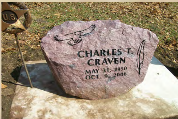
Boulder Memorial Baraboo Quartzite 24x16x12