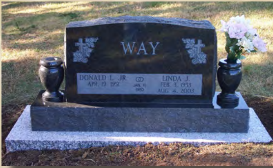
Upright Memorial American Black 36x6x20 Tablet 48x12x6 Base

Please know that we can craft a design based on your requests