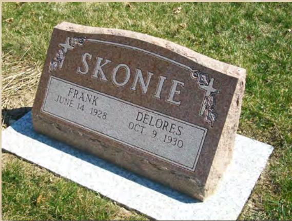
Slant Memorial Morning Rose 30x10x16 Slant