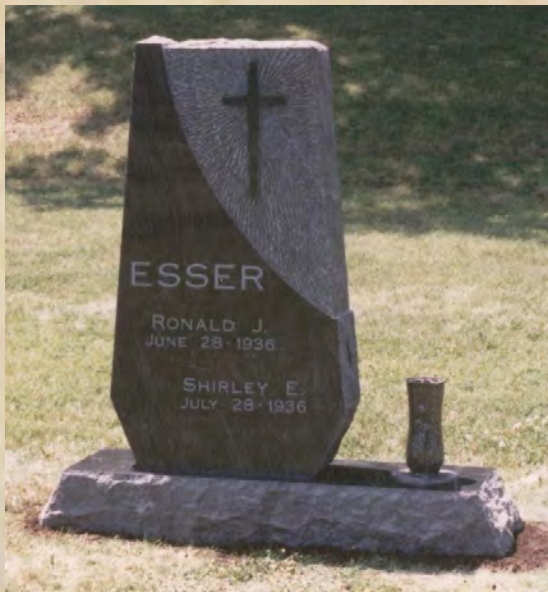
Upright Memorial American Black 24x6x48 Tablet 48x12x6 Base