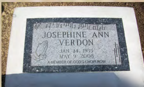
Flush Memorial Blue Pearl 28x16x4