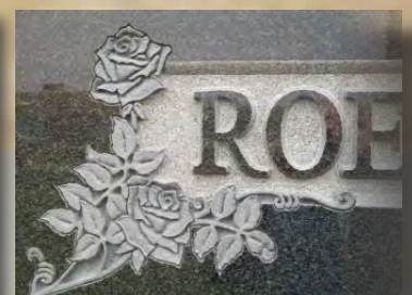
Hand-Tooled Cross and Shape-Carved Roses