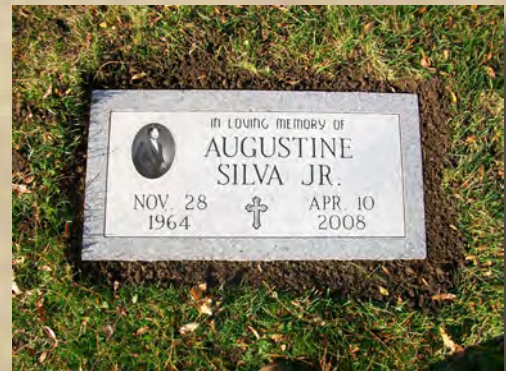
Flush Memorial Southern Gray 24x12x4