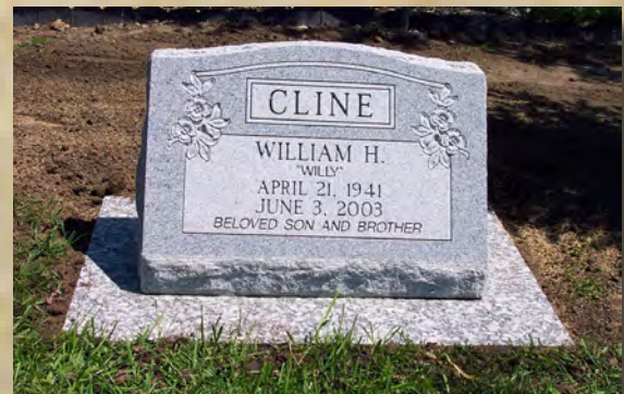
Slant Memorial Southern Gray 24x10x16 Slant